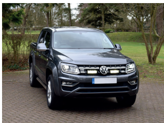
VW AMAROK 2016+