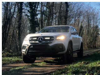
MERCEDES X-CLASS 2016+

Thank you for choosing a Lazer Lamps product. Vielen Dank dafür, dass Sie sich für ein Produkt von Lazer Lamps entschieden haben. Merci pour choisir un produit de Lazer Lamps. Gracias por la seleccion de productos de Lazer Lamps.