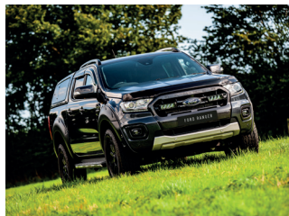
FORD RANGER 2019+