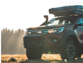
TOYOTA HILUX 2017+